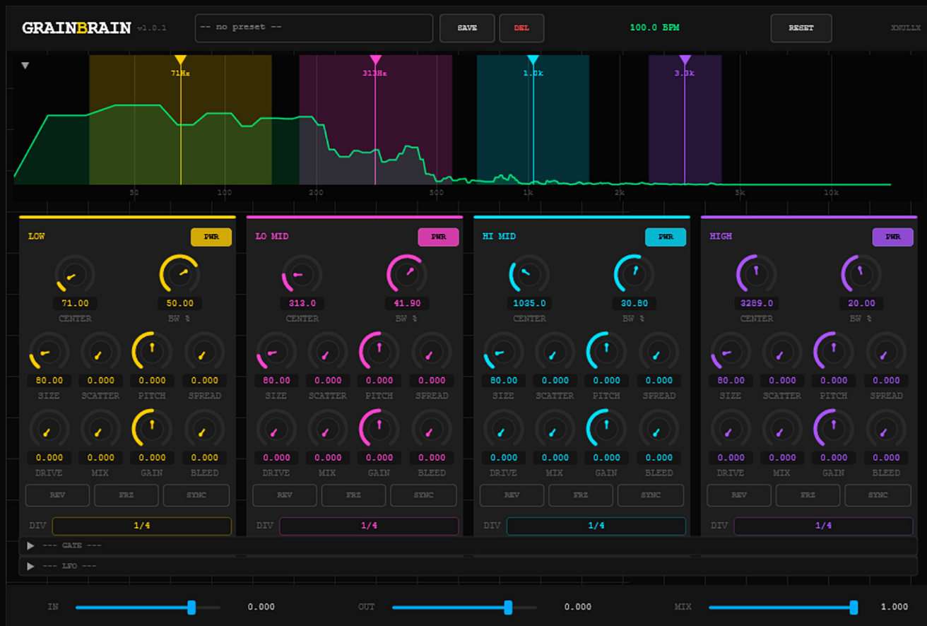
GrainBrain at its most compact: the frequency display condensed and the GATE and LFO sections collapsed. The window resizes to fit, leaving just the band filter and grain controls.