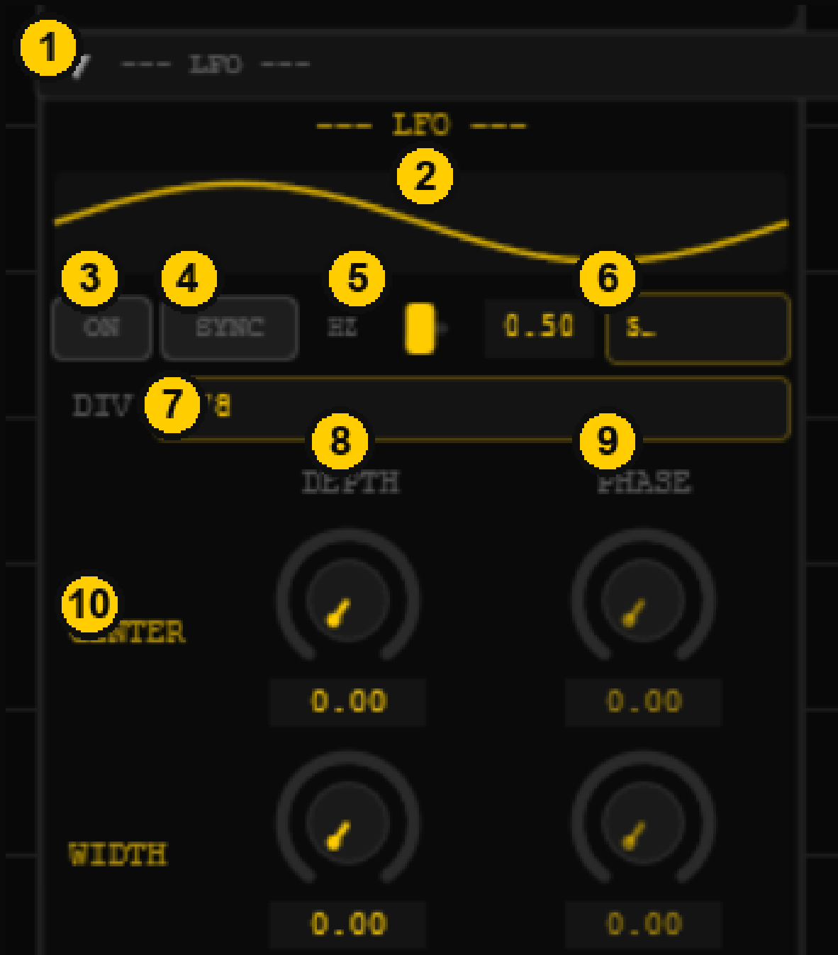
The LFO section – global controls and the per-target Depth/Phase columns.

Each band has a dedicated LFO that can modulate up to seven parameters simultaneously. The LFO system uses a phase-offset architecture – a single oscillator runs per band, and each target reads the oscillator at its own phase offset, making each target's modulation feel independent while sharing a common rate.