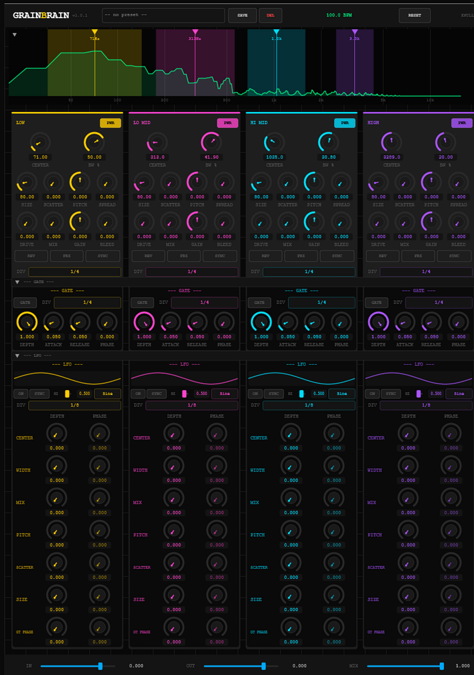
The full GrainBrain interface with all sections expanded. The bottom bar carries the master In, Out, and the ducked Mix.

The GrainBrain window is organized top-to-bottom into a top bar, the spectrum analyzer, four band strips, and a bottom output bar.