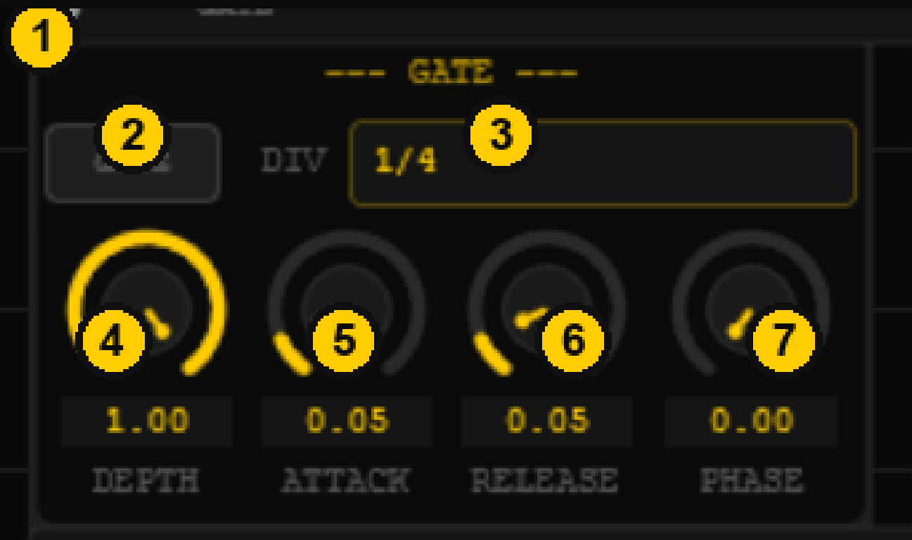
The GATE section.

The gate cycle repeats at the rate set by its DIV control. Using different Phase values across bands lets different frequency regions pulse at rhythmically offset positions – for example, Low gating on the beat while HiMid gates on the offbeat.