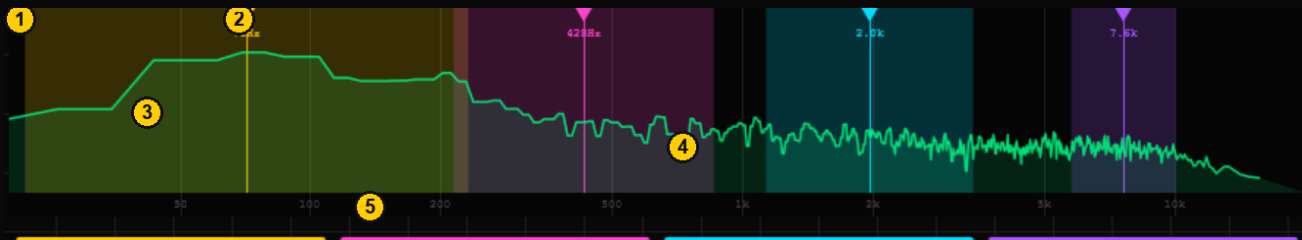
The spectrum analyzer / frequency display.

The spectrum analyzer occupies the top section of the plugin window. It displays a real-time FFT of the input signal with a logarithmic frequency axis (20 Hz - 20 kHz). Four colored regions - gold (Low), pink (LowMid), cyan (HiMid), violet (High) - represent each band's active frequency range.